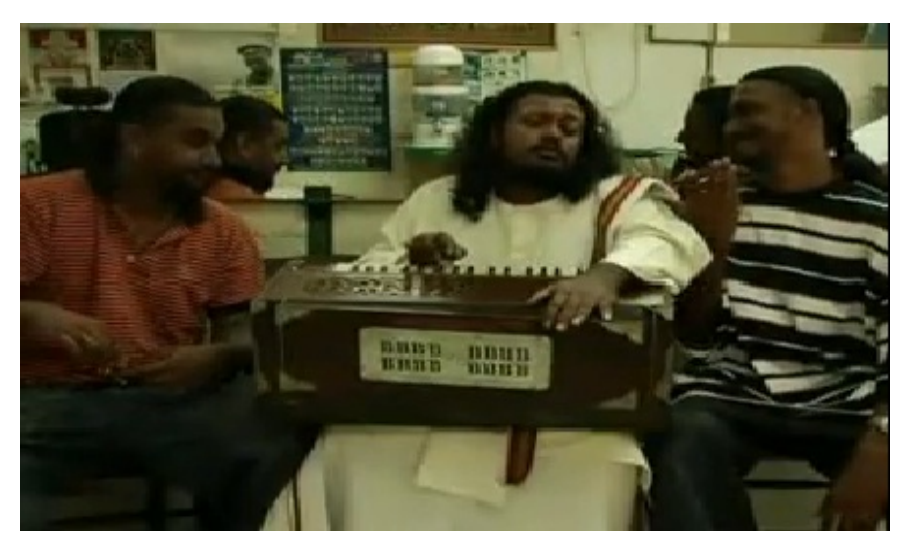
Photo 7: The music video of "Madai Thiranthu" (youtube.com) Source: Yogi-B and Natchatra, 2006b

The song's music video increases the impact of this facet. In the video, the Carnatic interlude mentioned above emerges in a scene that shows an Indian male dressed in the traditional attire of a Carnatic musician and carrying a traditional portable hand-pumped wooden harmonium, which he plays with much spirit (see Photo 7). Considered to have been introduced into India by French missionaries during the Raj, the harmonium symbolises cultural adaptation. Subsequently, the instrument was used in local music. When considered against the backdrop of the song's hip-hop poetics, the harmonium draws attention to a little-noticed historical manifestation of cosmopolitanism and liberates the song from the limitations of contemporary Metropolitan consciousness.