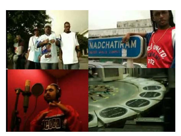
Photo 8: The collage from the music video of "Madai Thiranthu" (youtube.com) Source: Yogi-B and Natchatra, 2006b

The song concludes with an integration of Tamil sangeetham notes and the well-known Tamil poetic discourse puthukkavithai of the famous Tamil poet and freedom fighter Bharathy, or Mahakavi Subramanya Bharathiyar. The discourse is particularly significant in its references to struggle and sacrifice, as mattum in the lines "Iraivan arivaan...Naan vervai...ratham...thiagam..." (Only God understands the sacrifices of my sweat and blood/poetic fighter for life...). The evocation of Bharathiyar's struggle can be considered to refer to the struggle of the artists to establish themselves on the local and global musical stage. Thus, the song's images and lyrics represent the dismantling of orthodox cosmopolitanism's Western framework while including and emphasising Asian multiculturalism.