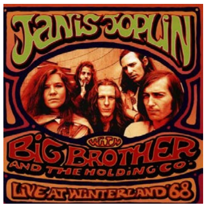
Photo 2: The album cover of Janis Joplin with Big Brother and the Holding Co.

The similarities of the two covers depicted above, i.e., the psychedelic style of the font, the design and the overall colour scheme, reflect the "canvas of emerging possibilities generated by local negotiations of transnational currents," that Tsioulakis has used to refer to the popular imagination (Tsioulakis, 2011: 176). A distinct sense of place and a geographical space characterised the music of the 1960s. This element has been inherited by modern popular artists, as discussed below. In this connection, the following album cover from the group A. Rahman Mohd. and the Fabulous Orchids is interesting.