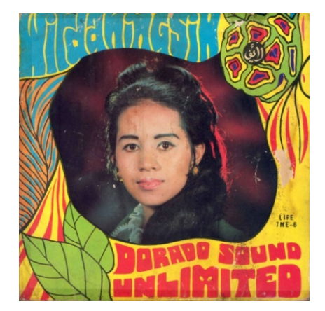
Photo 1: The album cover of Wirdaningsih and the Dorado Sound Unlimited

to witness the extent of the transcultural flow of popular culture, which subsequently was intermingled with the local music scene.