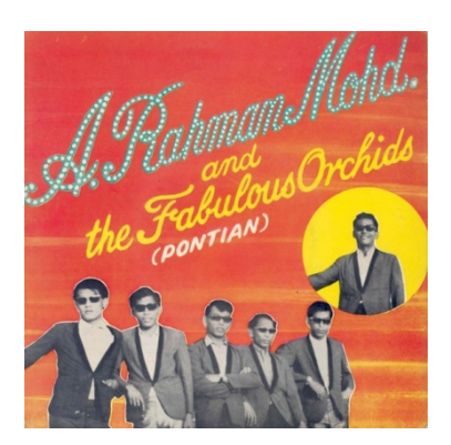
Photo 3: The album cover of A. Rahman Mohd. and the Fabulous Orchids

The similarities of the two covers depicted above, i.e., the psychedelic style of the font, the design and the overall colour scheme, reflect the "canvas of emerging possibilities generated by local negotiations of transnational currents," that Tsioulakis has used to refer to the popular imagination (Tsioulakis, 2011: 176). A distinct sense of place and a geographical space characterised the music of the 1960s. This element has been inherited by modern popular artists, as discussed below. In this connection, the following album cover from the group A. Rahman Mohd. and the Fabulous Orchids is interesting.